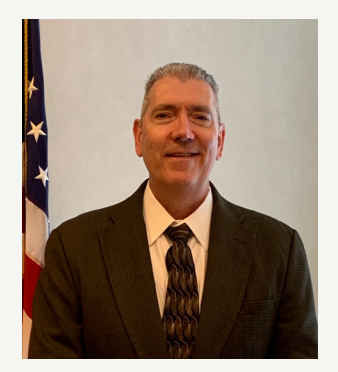
DANIEL FLANAGAN Kings Point Police Department Commissioner

These reductions have been made possible by several factors, first and foremost the hard work of our Kings Point Police Department officers. The department's close coordination with the Nassau County Police Department investigative units is also a key component for fighting crime, as is the Village's continued investment in upgrading our various security technologies. Finally, the vigilance of our residents has been equally important. The Kings Point Police Department reminds all residents to report suspicious vehicles, persons and activity by calling 516-482-1000, and of course to dial 911 in an emergency.