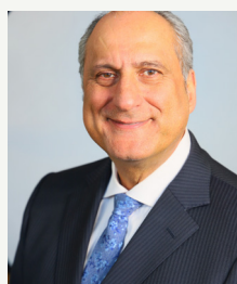
New Trustee EBI VICTORY